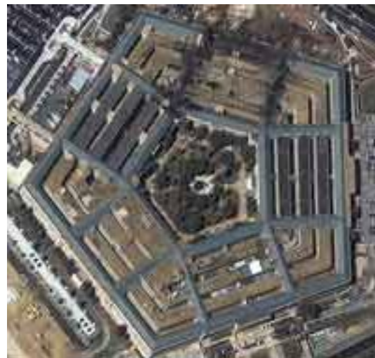
The satellite image of the Pentagon shows extensive damage (Top Right) to the western side and interior rings of the multi-winged building.