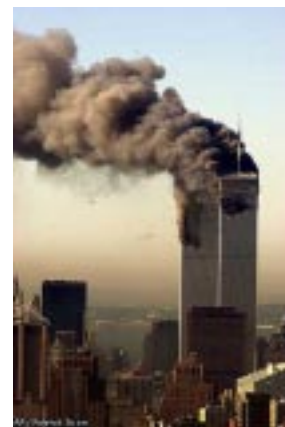
New York City - World Trade Center.