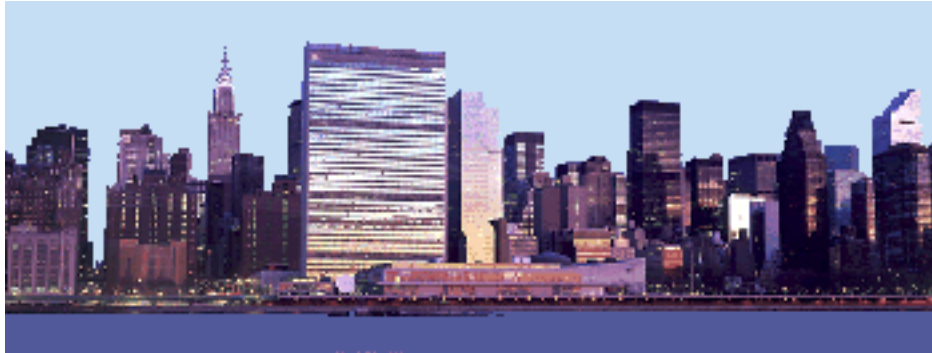
View of Manhattan Island from the East River. The wide building in the foreground is the United Nations Headquarters. Behind it, topped with arches and a spire, is the Chrysler Building.