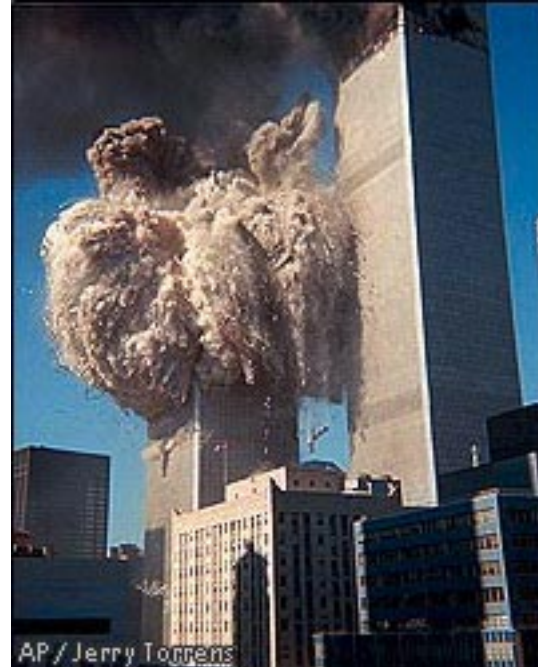
Collapse of WTC Tower 2 at 10:05 a.m ET September 11, 2001.

It caught fire and collapsed September 11, 2001: 6:07 p.m. ET hours after the landmark twin towers crumbled. The smaller building had reportedly been evacuated when the tower above it collapsed. Among the tenants of the building was the U.S. General Accounting Office, located on the 25th floor. Other nearby buildings were ablaze in the area