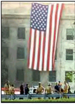
Rescue workers atop the Pentagon unfurl a U.S. flag