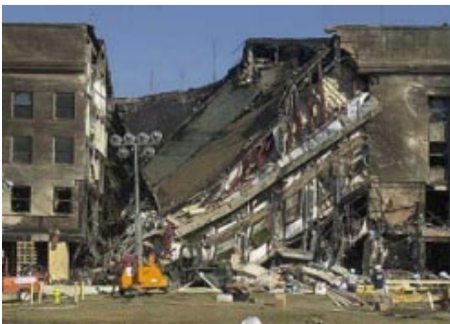
September 14, 2001 - Clean-up and rescue work continues at the Pentagon.

Houses Department of Defense, including Army, Navy and Air Force. It is the nerve center of the United States military infrastructure.