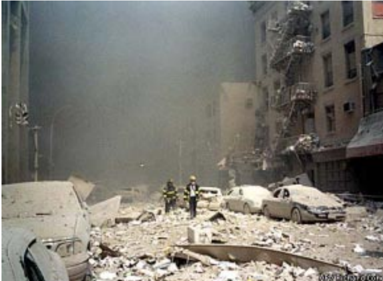
Firemen walked through a dust and debris covered street in lower Manhattan.