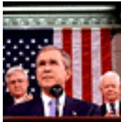
President George W. Bush Addresses the Nation September 20, 2001