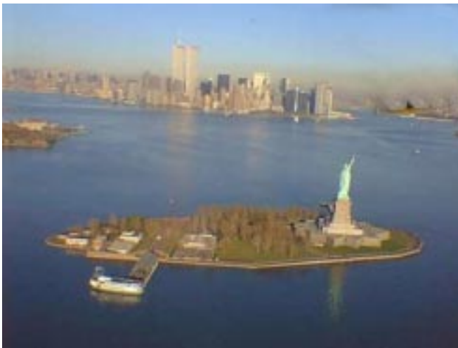
The Statue of Liberty (as seen from 1,500 feet) resides on Liberty Island in New York Harbor. The Financial District of lower Manhattan is visible in the background. The island to the left is Ellis Island. Both the Hudson River and the East River terminate at the Southern tip of Manhattan where it officially becomes Upper New York Bay, or more popularly, New York Harbor. The statue is about 2 miles South of tip of Manhattan.