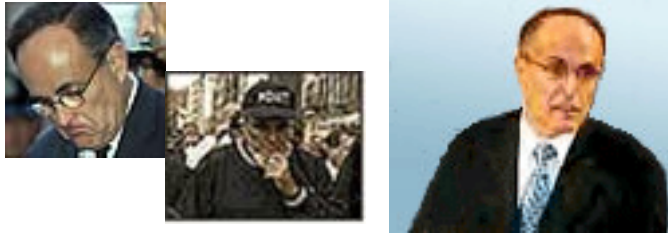
New York Mayor Rudolph Guiliani