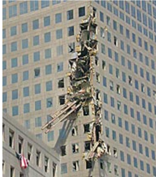
A 600,000-pound beam from the World Trade Center is lodged in a nearby building