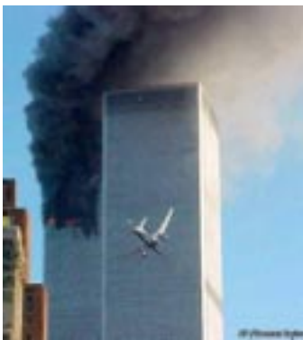
Associated Press photo by Carmen Taylor - Photo Gallery - SFGate